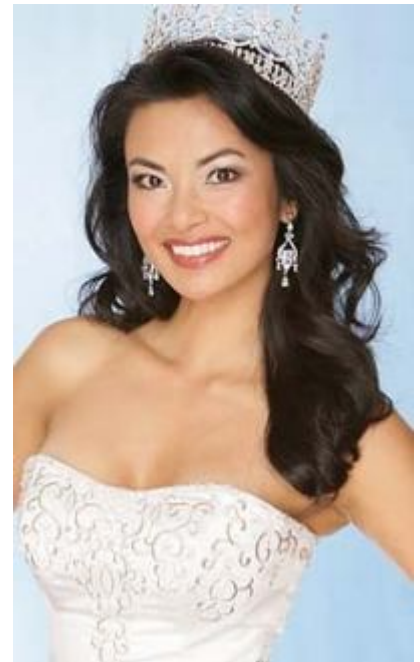
Korean American woman was crowned Ms. America