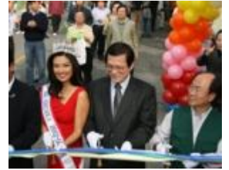
Appearance at the JBC Charity Bazaar opening ceremony.