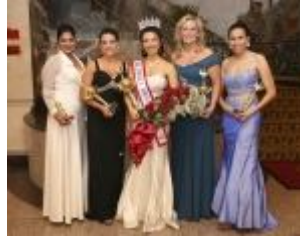
Congratulations to the winner and runner ups!