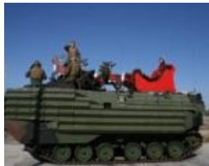
Arriving with Santa in his sleigh on top of a amphibian tank at Camp Pendleton