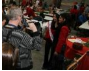
Taking pictures with fans!