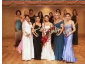
Top 5 and all the finalists