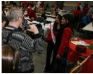
Taking pictures with fans!