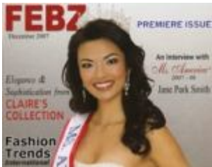
FEBZ Magazine Cover Model ~ Dec 2007