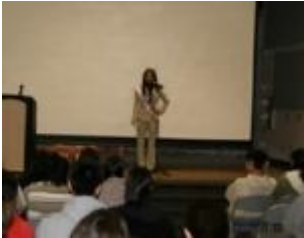
Guest Speaker for Youth Conference on AIDS