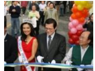
Appearance at the JBC Charity Bazaar opening ceremony.