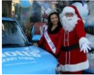
Visiting with Santa at Knotts Berry Farm