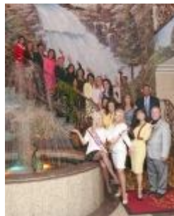
Photo of all contestants, judges and queens taken at Verdugo Hills Country Club.