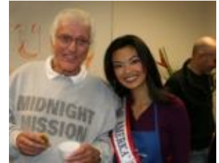
MIDNIGHT MISSION - Los Angeles Ms. America with TV Film Star Dick Van Dyke