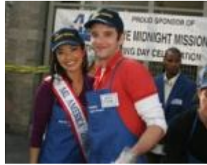
MIDNIGHT MISSION Feeding the Homeless on Thanksgiving Day with Eric Mabis who plays Daniel Mead on the Award Winning TV Show UGLY BETTY