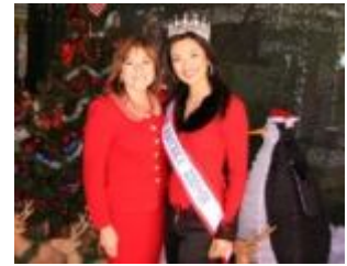
Meeting Congresswoman Loretta Sanchez