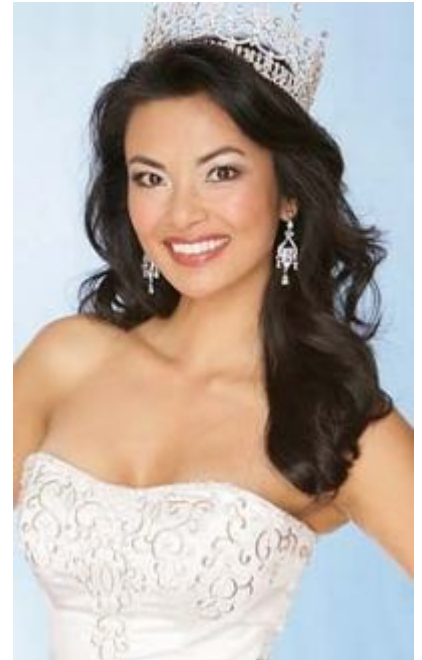
Korean American woman was crowned Ms. America

Sponsors of the Ms. America ® Pageant include: Martinizing Dry Cleaning of Costa Mesa, Ken Herczeg Photography, OC Internet Advertising and Verdugo Hills County Club.