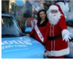
Visiting with Santa at Knotts Berry Farm