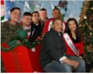
"Words Of Comfort, Hope And Promise" Holiday Event