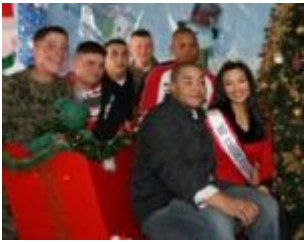
"Words Of Comfort, Hope And Promise" Holiday Event