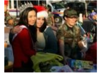
"Toys For Tots" drive with the Marines