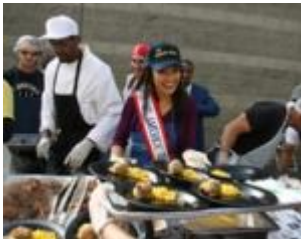
FEEDING THE HOMELESS MIDNIGHT MISSION Thanksgiving Day