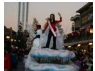
Grand Marshall for Knotts Berry Farm Holiday Parade