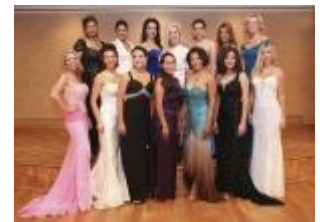
Finalists in Evening Gown Competition