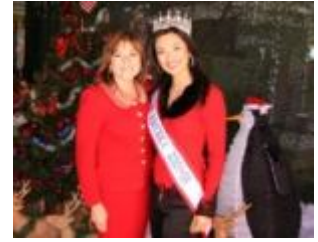
Meeting Congresswoman Loretta Sanchez