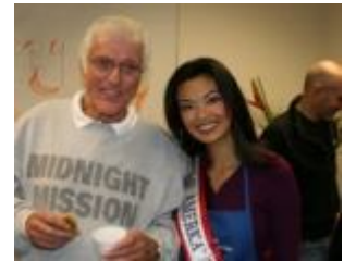
MIDNIGHT MISSION - Los Angeles Ms. America with TV Film Star Dick Van Dyke