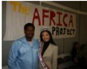
Appearance at THE AFRICAN PROJECT WEEK conference