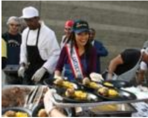
FEEDING THE HOMELESS MIDNIGHT MISSION Thanksgiving Day