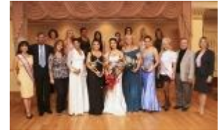
Winner, top-5, finalists, judges, queens and volunteers of the Ms America Pageant