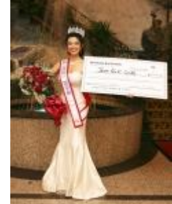
Thank you to our sponsor Martinizing Dry Cleaning Service for a $500.00 cash prize!