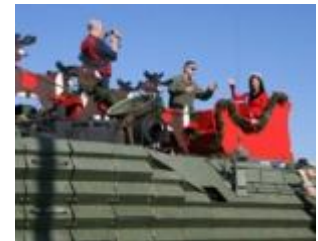
Preparing for the ride with Santa