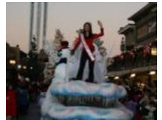
Grand Marshall for Knotts Berry Farm Holiday Parade